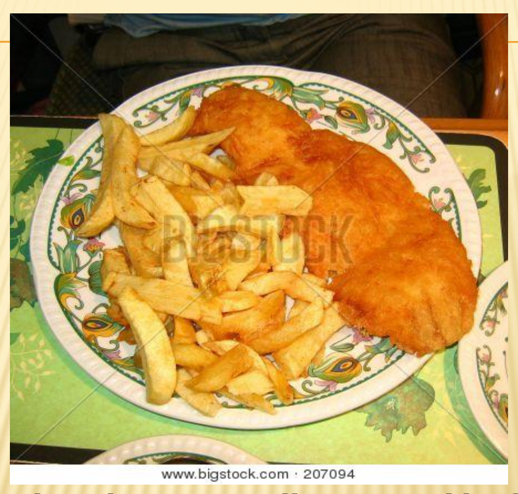
It is time between dinner and before they go to bed