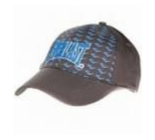
5. c p f