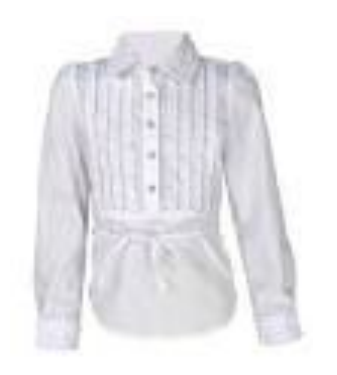
2. f b e