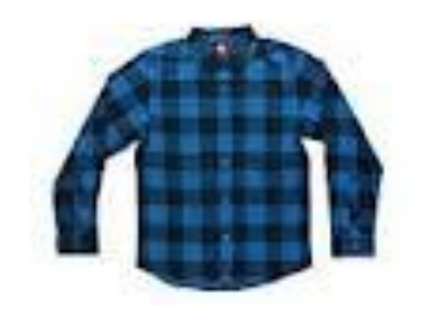
4 . w s v