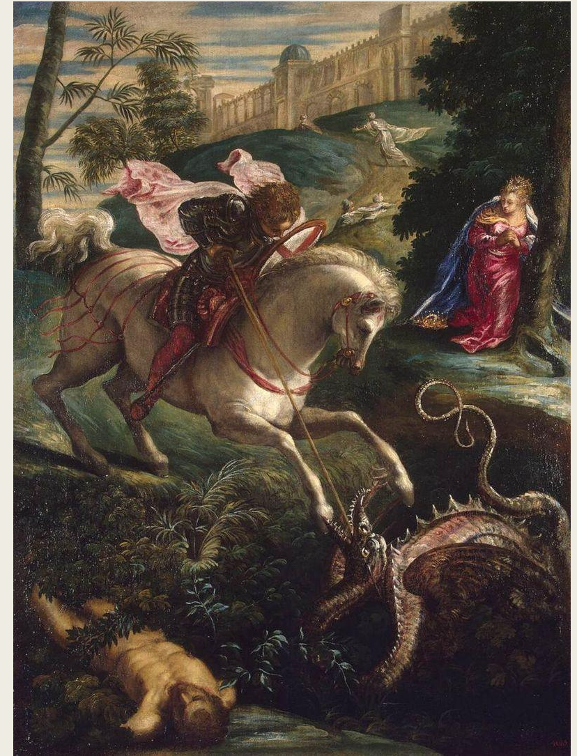
«St. George and the dragon» Jacopo Tintoretto