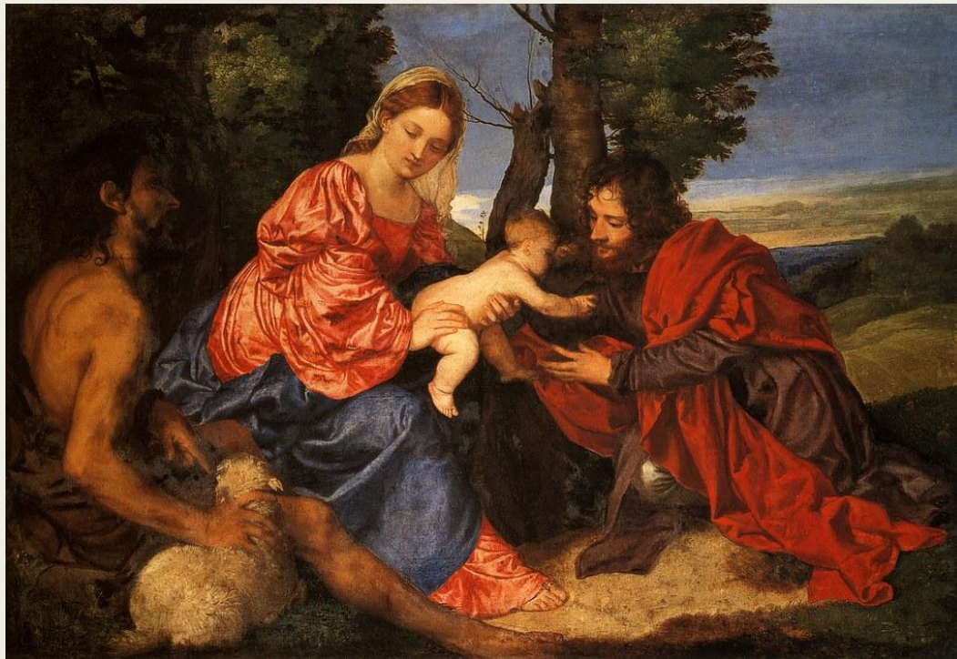
Titian «St. Family»