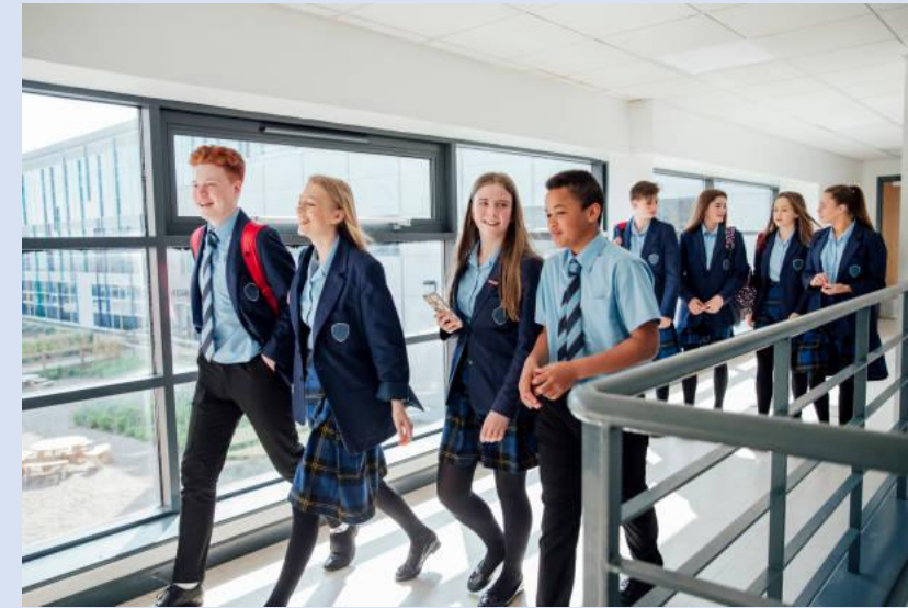
High school (16-18)