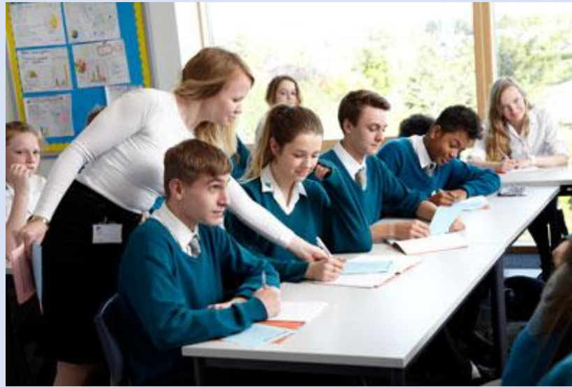
Secondary school (11-16)