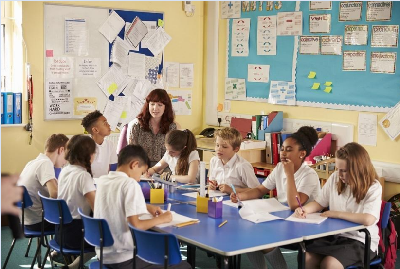
Primary school (5-11)