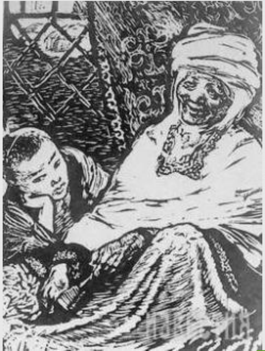
Abai grandmother Zere