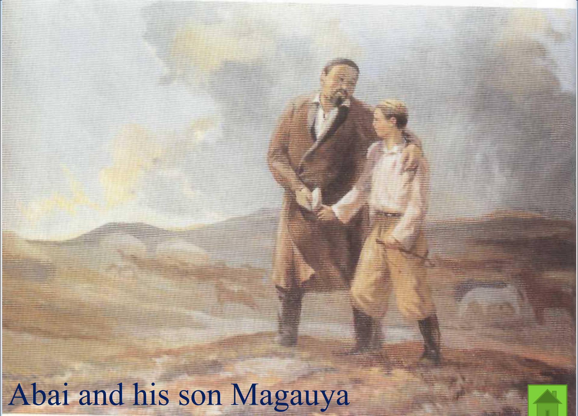
Abai and his son Magauya