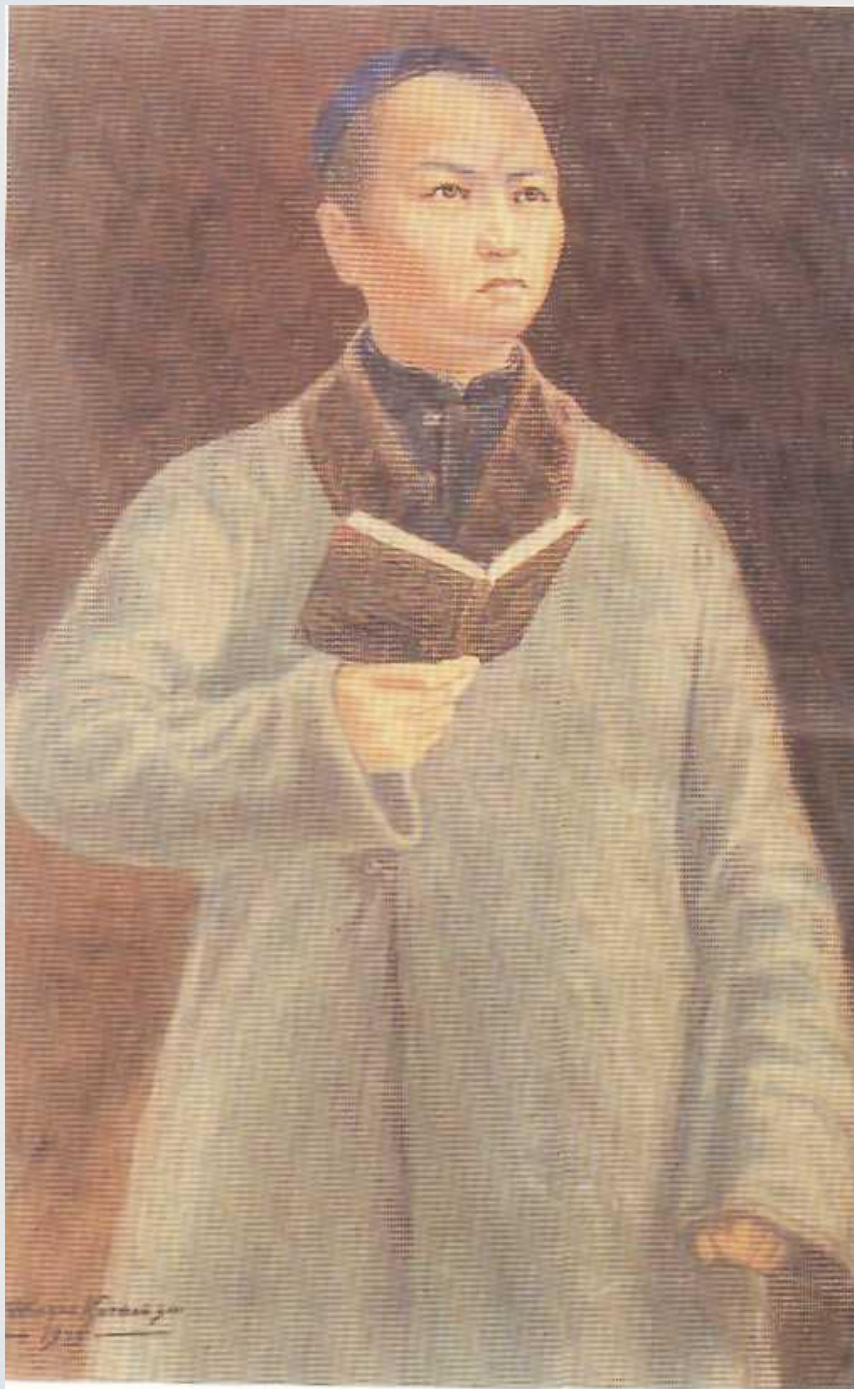
Young Abai Kunanbayev