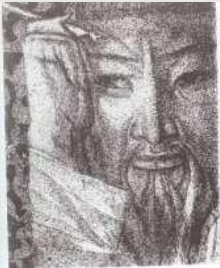
Illustration for the novel by M. Auezov «Abai's Path»