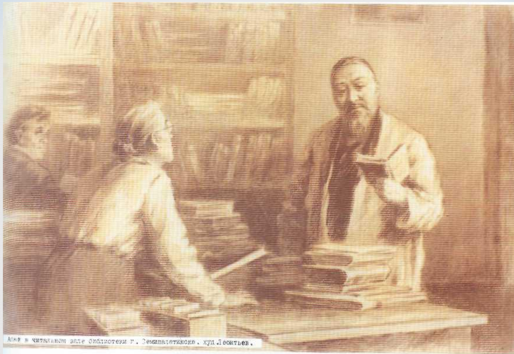
Абай в читальном зале библиотеки г. Семипалатинска. худ. Лоскутов.