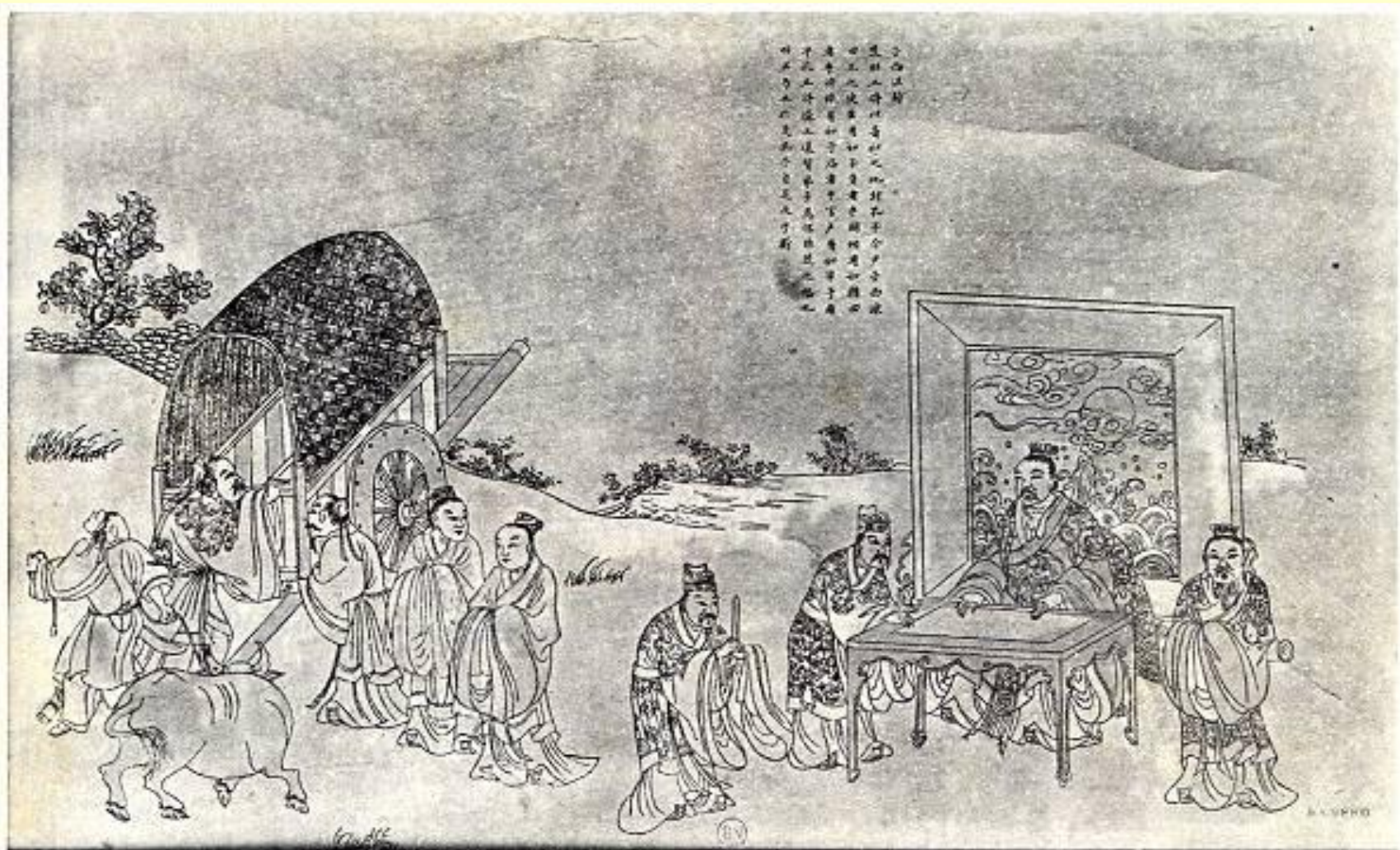
Confucius receiving a visitor, from Scenes from the Life of Confucius , in the Bibliothèque Nationale, Paris.