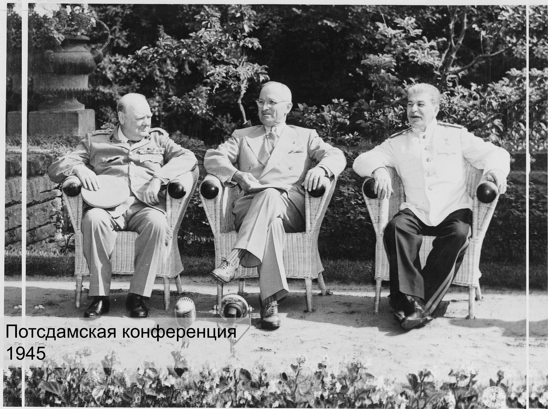
Потсдамская конференция 1945