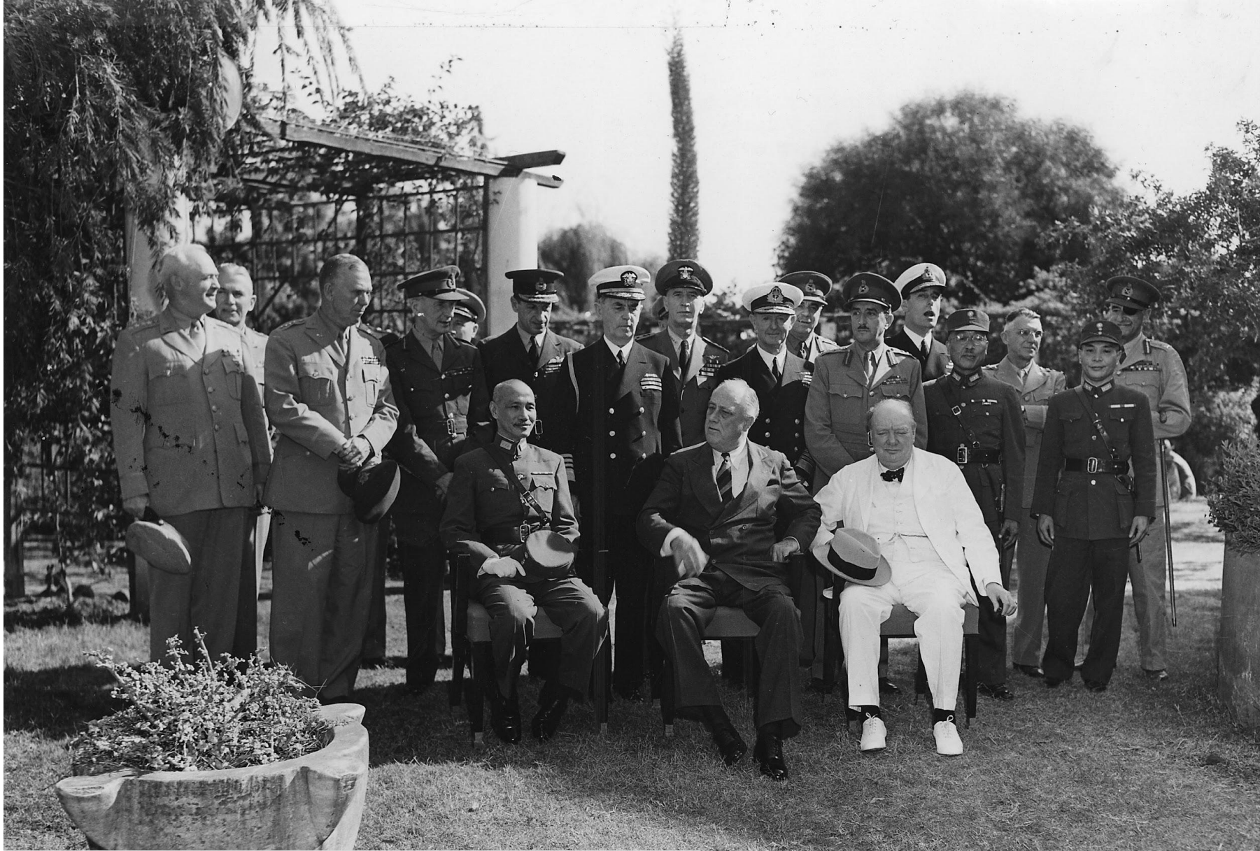
Тегеранская конференция. Иран, 1943