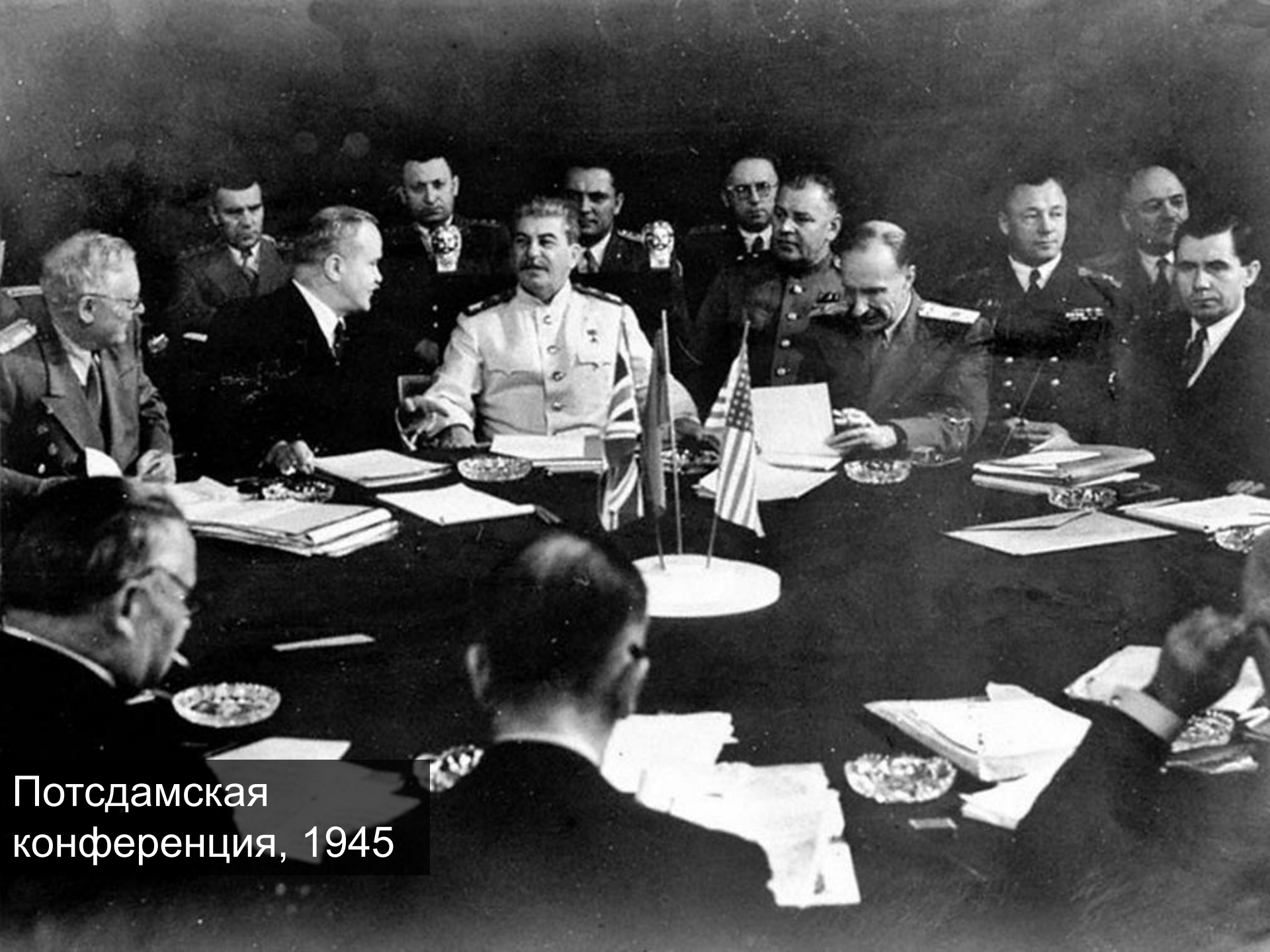
Потсдамская конференция, 1945