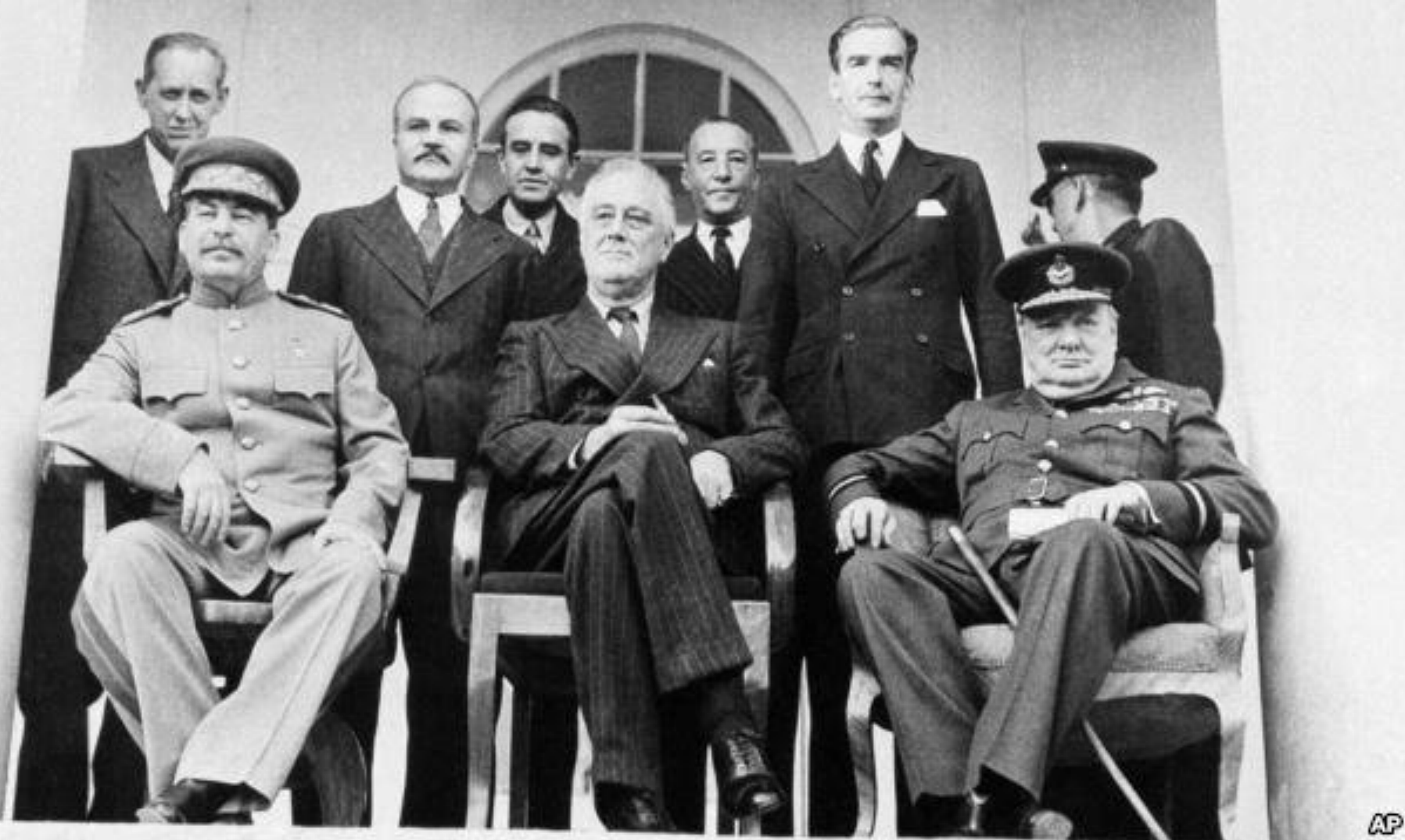
Тегеранская конференция. Иран, 1943