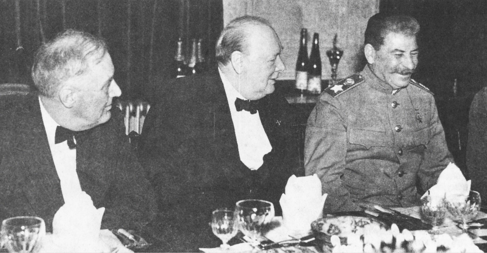
Тегеранская конференция. Иран, 1943