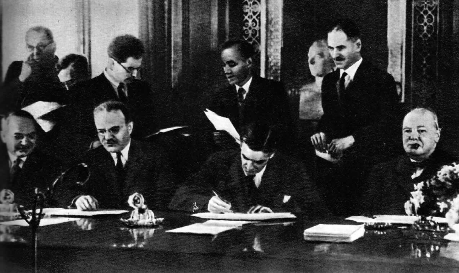
Подписание англо-советского договора в Лондоне о союзе в войне против гитлеровской Германии и о сотрудничестве и взаимной помощи после войны в течение 20 лет