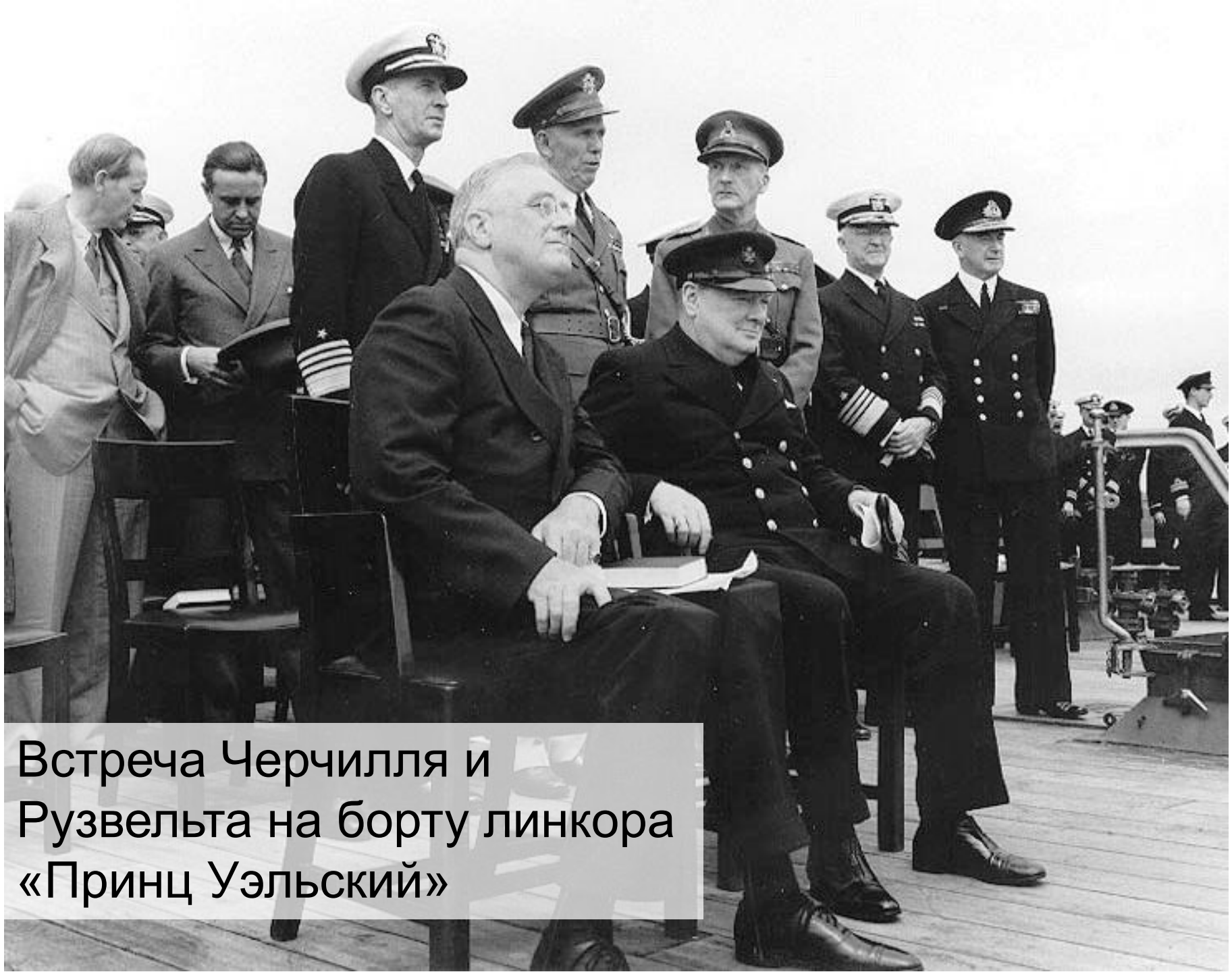
Встреча Черчилля и Рузвельта на борту линкора «Принц Уэльский»