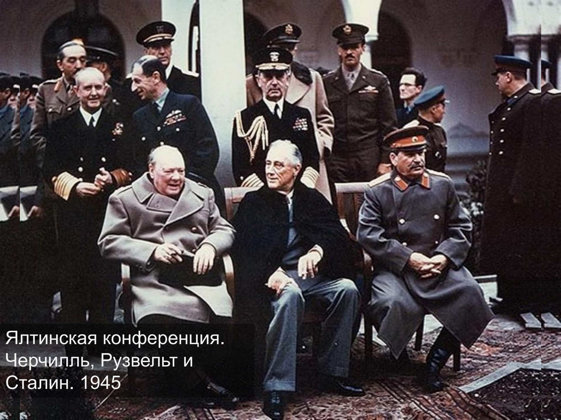
Ялтинская конференция. Черчилль, Рузвельт и Сталин. 1945