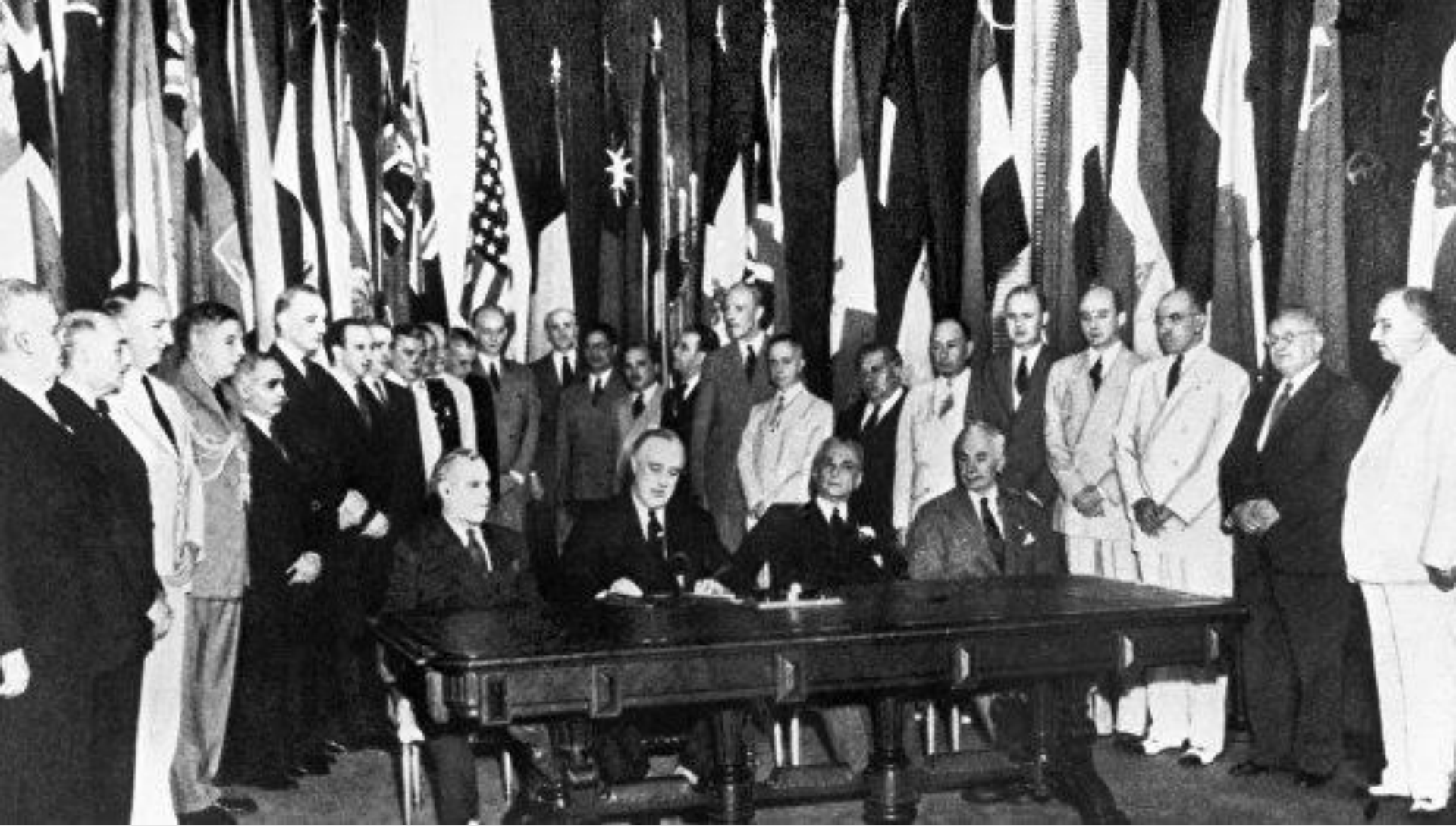
Подписание 1 января 1942 г. «Декларации объединенных наций»