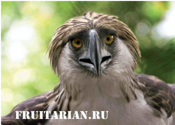
The Philippine eagle