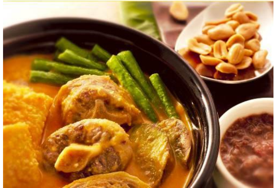
Kare-Kare is the pork and vegetable stew with rich and creamy peanut butter