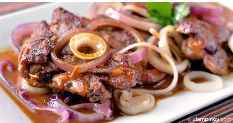
Adobo – pork or chicken braised with lemon or vinegar, soy sauce and spices