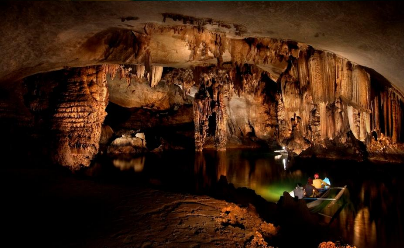
Underground river Puerto Princesa