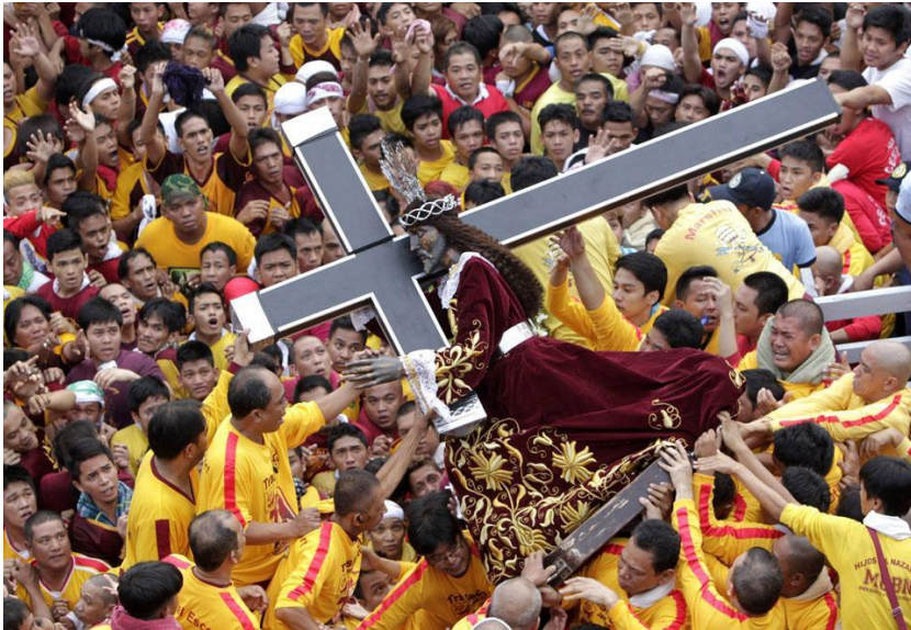
Day Of The Black Nazarene. The procession dedicated to Christ.