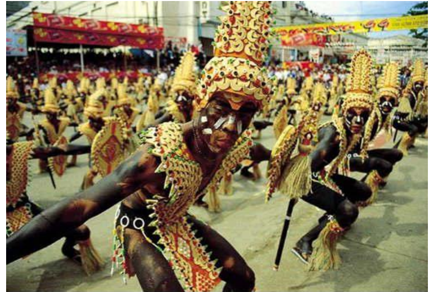
ATI-atihan. The three-day festival, dedicated to the Holy Infant Christ and the memory of the meeting of the Malays with the black ATI tribe.