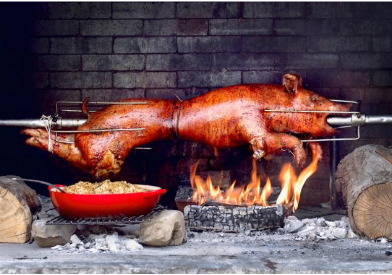
Lechón is roast suckling pig