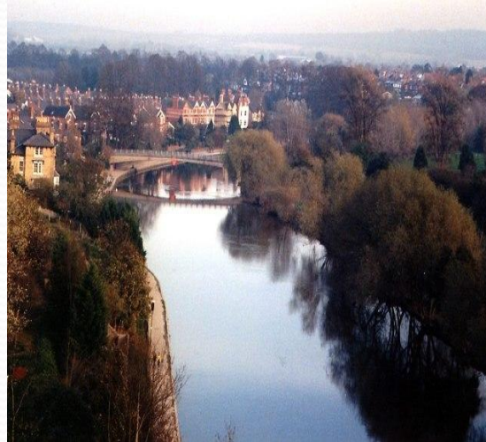
The river severn