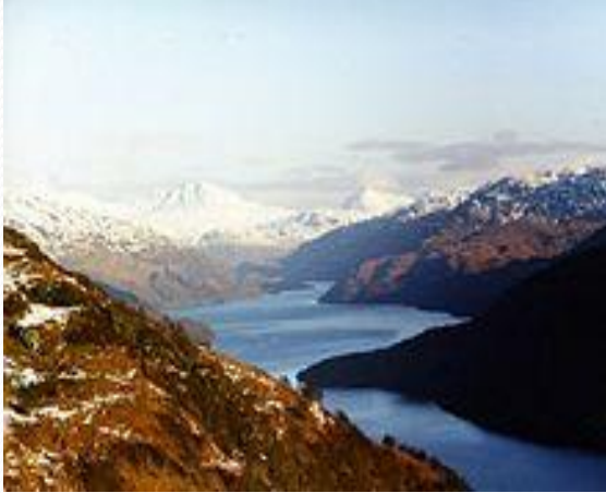
Loch Lomond in winter