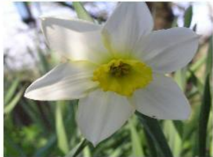
the symbol of Wales is the daffodil