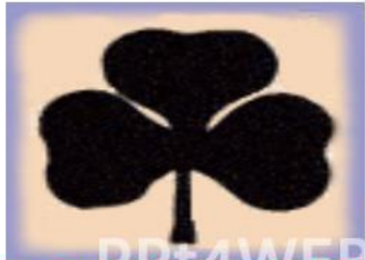
The symbol of Northern Ireland is the shamrock