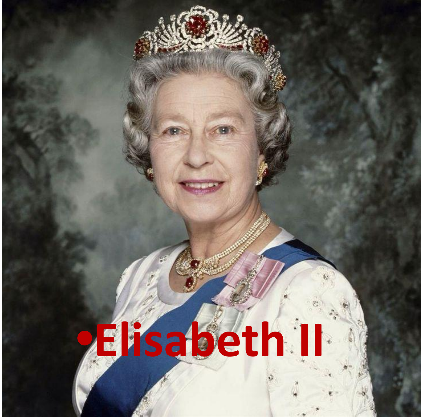
• Elisabeth II