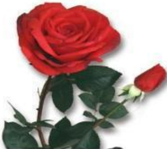
the symbol of England is the red rose