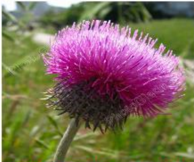
the symbol of Scotland is the thistle