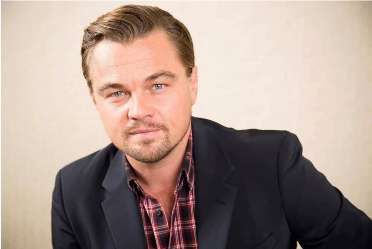
Leonardo Di Caprio