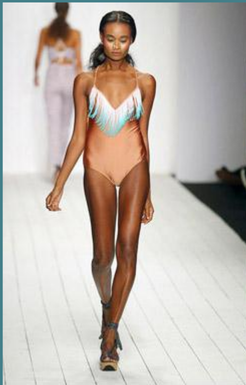
6 SHORE ROAD