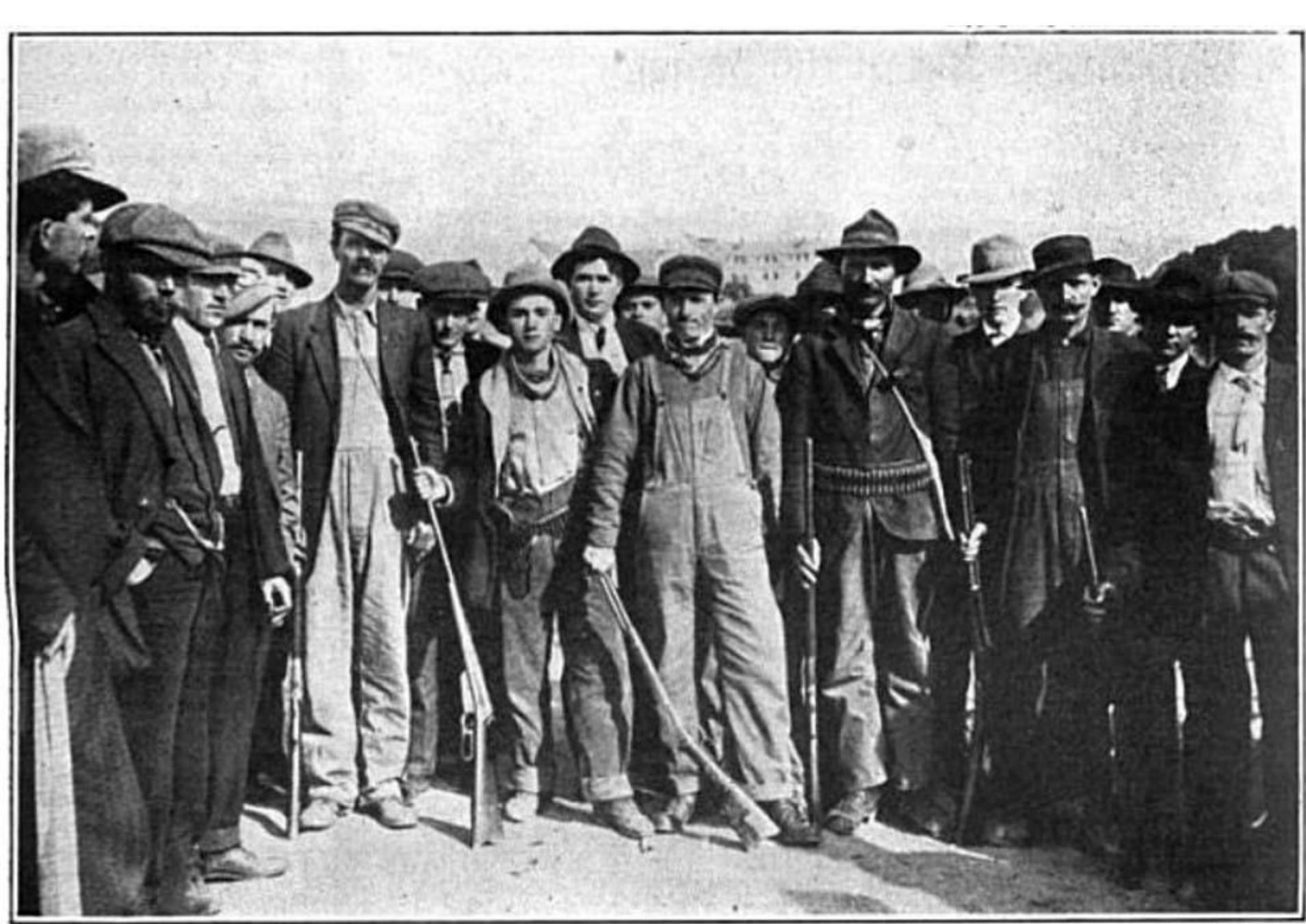
ARMED STRIKERS IN THE TRINIDAD DISTRICT IN COLORADO